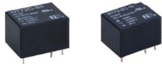
22.3×17.3×15 21.4×16.5×15 (NT72-2)